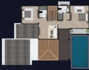
Second floor plan