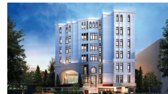
Launched The 8 Collection and Rich Park Terminal Laksi Station