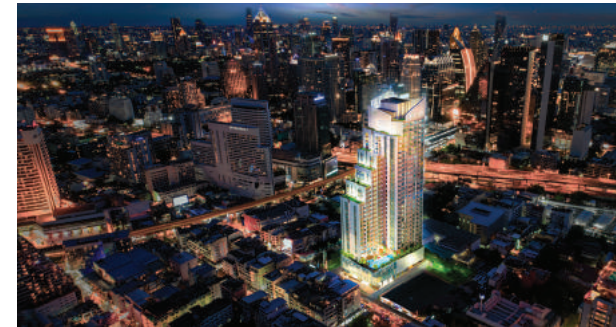
Launched The Rich Park Triple Station and The Rich Ploenchit - Nana