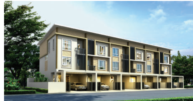
Launched The Rich Biz Home and Rich Park Chaophraya