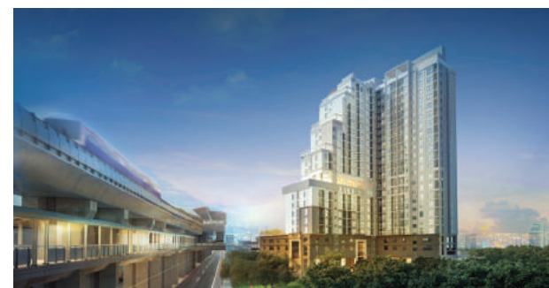
The company entered the stock exchange on August 2014 with a registered capital of 714 million baht Launched The Rich Ville Ratchapruk and The Rich Sathorn - Taksin