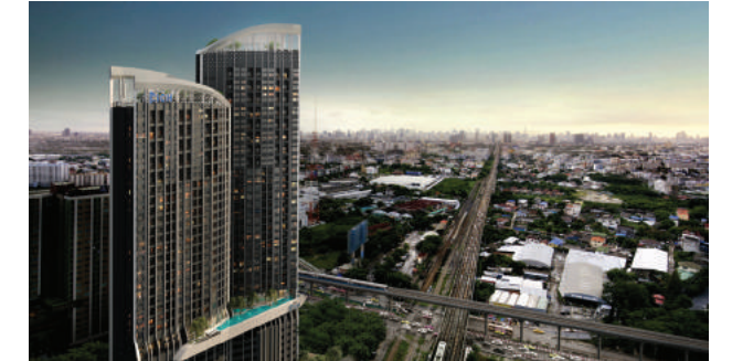
Launched The Rich Rama 9 Srinakarim Triple Station Branding The Rich